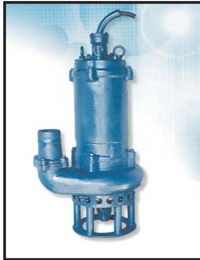
3HP to 150HP Units 4" to 12" Discharge Tungsten Carbide Seals