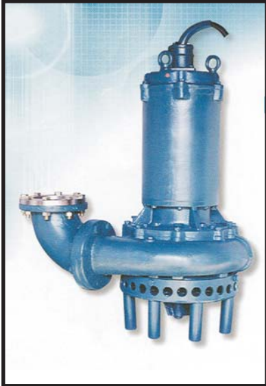
DGP & DGPN Models with Agitators Flows to 2500 GPM and Heads to 100 Feet.